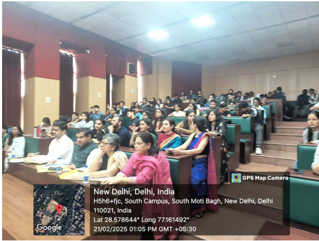
Amphitheatre during the event