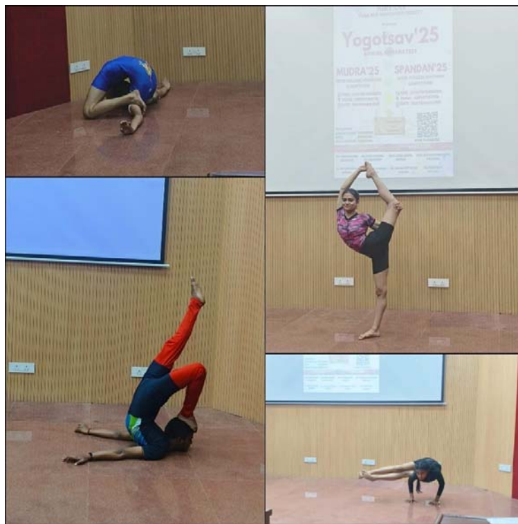
Spandan – Rhythmic Yoga Competition