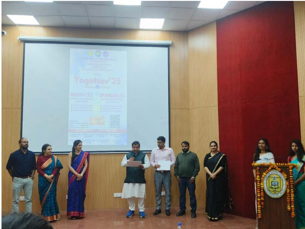
Announcement of the winners