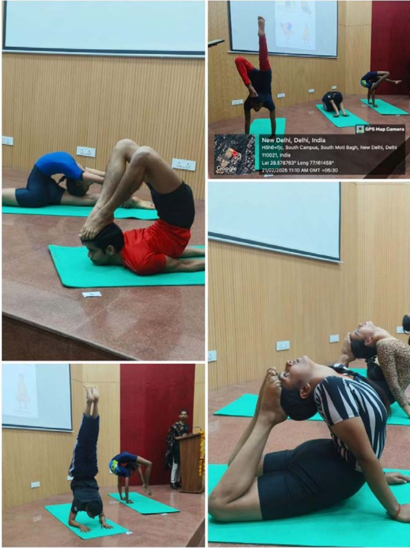
Mudra – Traditional Yogasana Competition