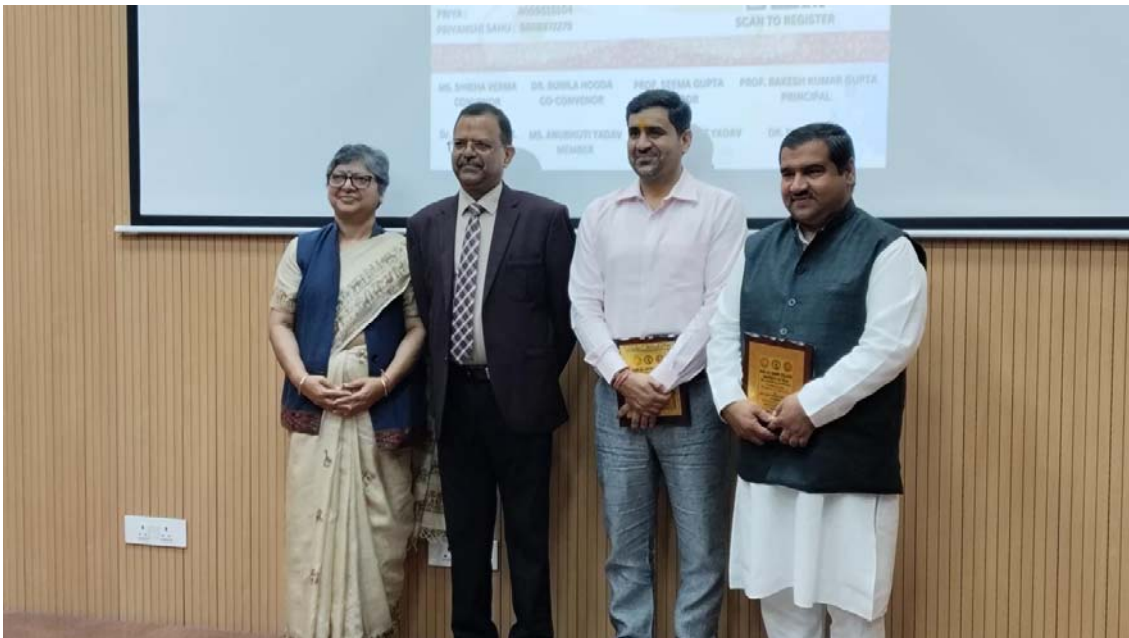
Felicitations of the guests by the Principal and Advisor