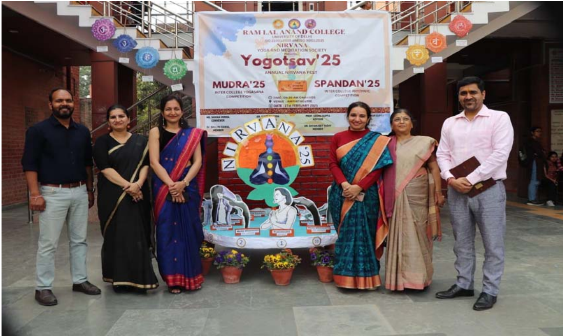
Faculty members with guests.

such events in the future to encourage the practice of yoga and overall well-being among students.